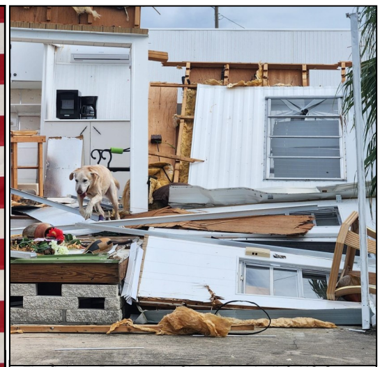
Firefighter-Paramedic Chad Matchell & K9 Scout were honored to deploy to the southeast with WA TF-1 to aid in the rescue & recovery efforts following hurricanes Helene & Milton.